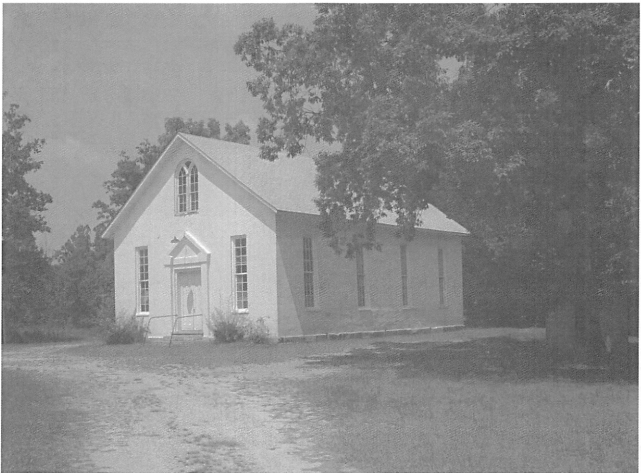
→ Mt. Olivet Presbyterian Church

(Church Cemeteries in the Eastern Section of the County)